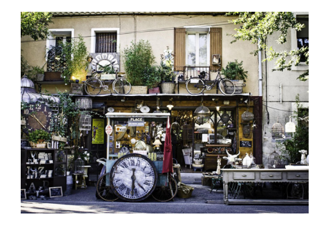
Day 2: Avignon / L'Isle-sur-la Sorgue / Gordes (70 km)

Pick up your Tesla electric vehicle in downtown Avignon. Depart for L'Isle-sur-la-Sorgues and its fabulous Antiques Market. Take time to browse, stroll and dine in one of the many restaurants overlooking the Sorgue.