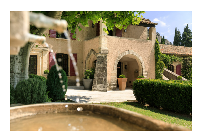
Day 6: Lourmarin / Saint-Rémy-de-Provence (70 km)

Today's route takes you from the Parc Naturel Régional du Luberon to the Parc Naturel Régional des Alpilles.