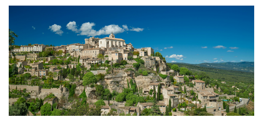
Day 4: Gordes / Roussillon / Lacoste / Lourmarin (50 km)

In the afternoon, enjoy the hotel's lovely swimming pool. Dinner and overnight in Gordes.